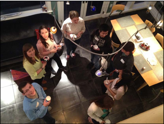
Admitted students chat with recent Harvard grads over ice cream